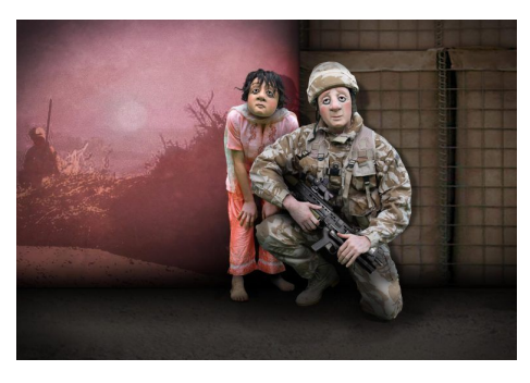
A Brave Face Fri 6 & Sat 7 Apr THE STUDIO £8.75 tickets