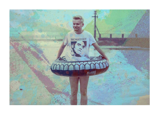
Rubber Ring Fri 9 Feb THE STUDIO £8.75 tickets