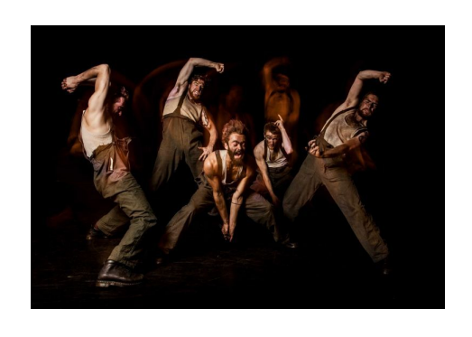
Coal Thu 8 Feb THE THEATRE £9.25 tickets