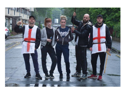
The Bold Knights Of Britian Thu 15 Mar THE STUDIO £8.75 tickets