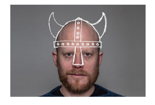
Beowulf Thu 8 Feb THE STUDIO £8.75 tickets