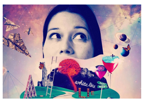
How To Survive A Post-Truth Apocalypse Wed 21 Mar THE STUDIO £8.75 tickets