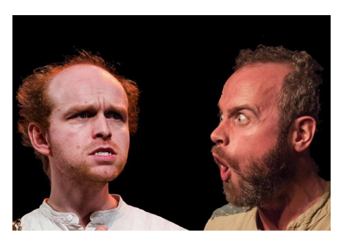
Macbeth Wed 28 Feb THE STUDIO £8.75 tickets