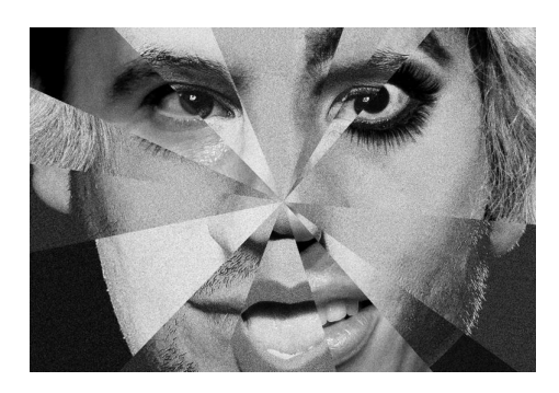
Testosterone Thu 1 Mar THE STUDIO £8.75 tickets