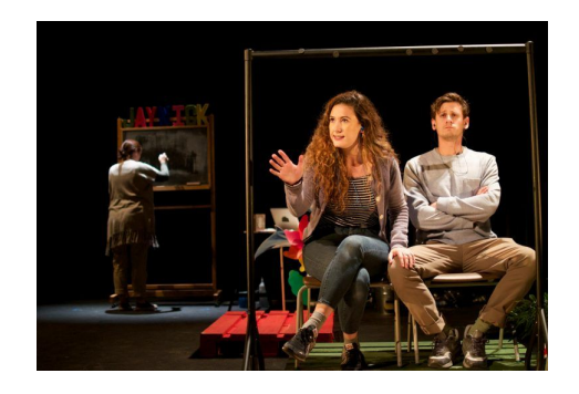
Carry On Jaywick Thu 22 Mar THE STUDIO £8.75 tickets