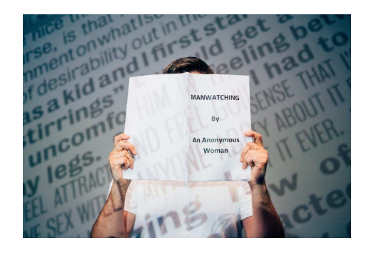
Manwatching Thu 15 Feb THE STUDIO £8.75 tickets