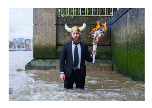
Team Viking Thu 18 Jan THE STUDIO £8.75 tickets