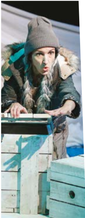
THE BONE ENSEMBLE PRESENT