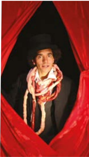
HALF MOON PRESENTS