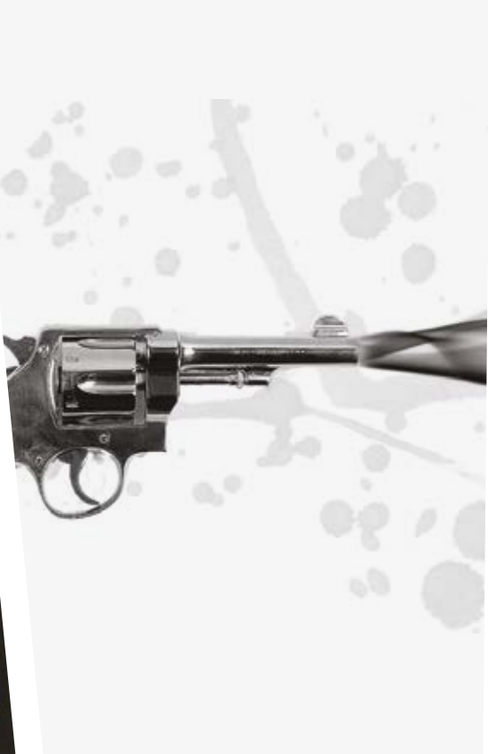
THE UNIVERSITY OF KENT MUSICAL THEATRE SOCIETY PRESENTS