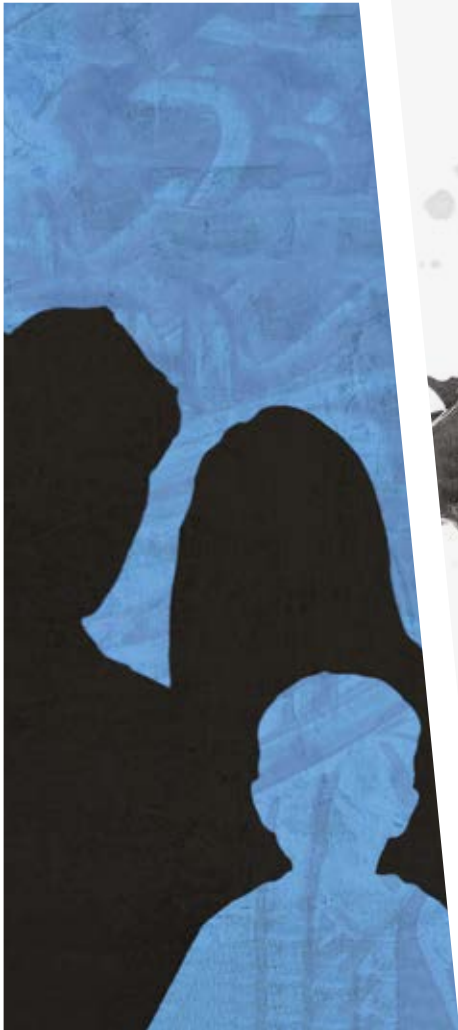
THE UNIVERSITY OF KENT'S T24 PRESENT