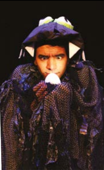
HALF MOON PRESENTS